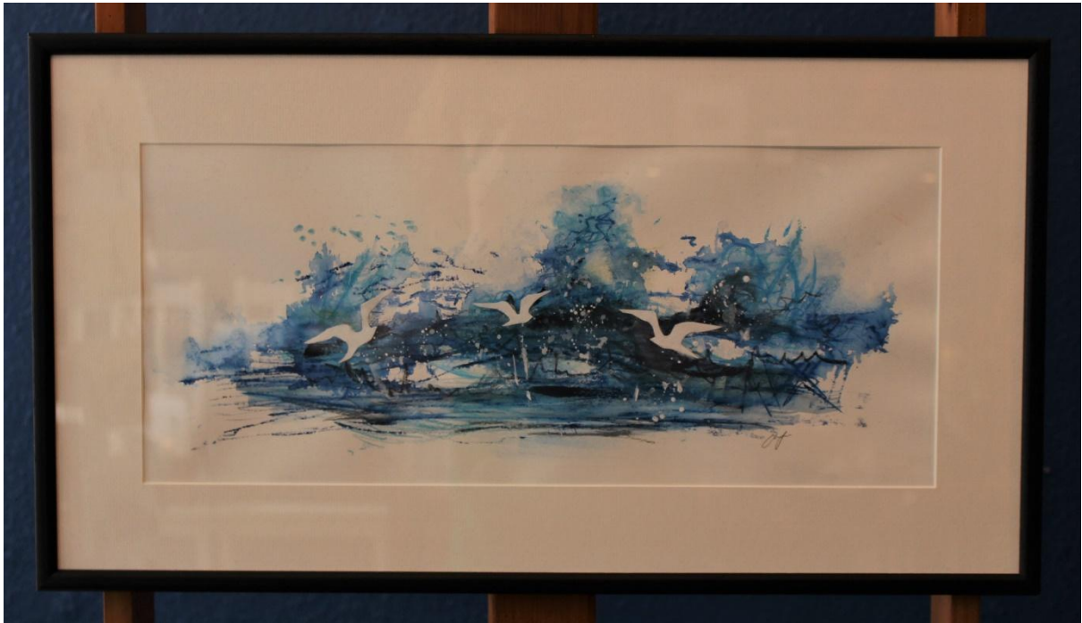
My Blue Mind: mixed media and collage 63x 34 cm £325.00