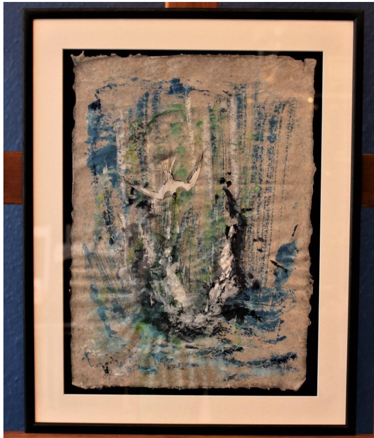
Tern Ahoy!: monprint with mixed media and collage on handmade paper 43 x 52 cm £325.00