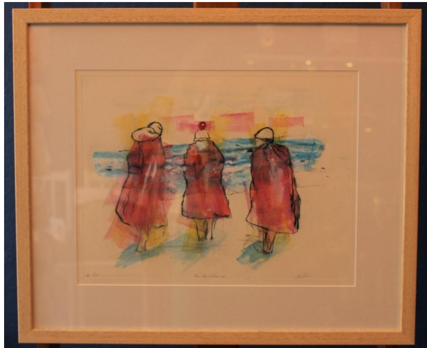
The Sea Within: drypoint etching with monoprint, 65 x 50 cm £275.00