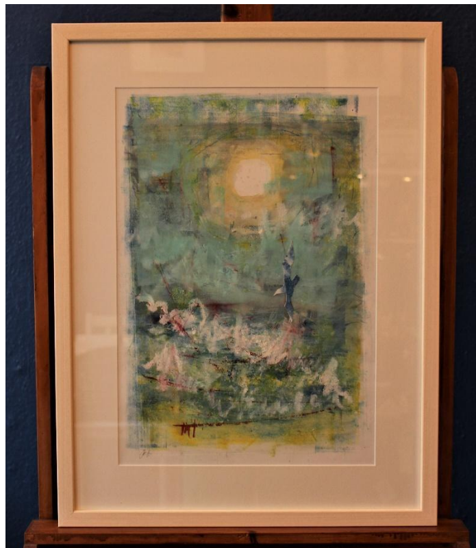
Sun worshipping: monprint with mixed media 50 x 65 cm £400.00