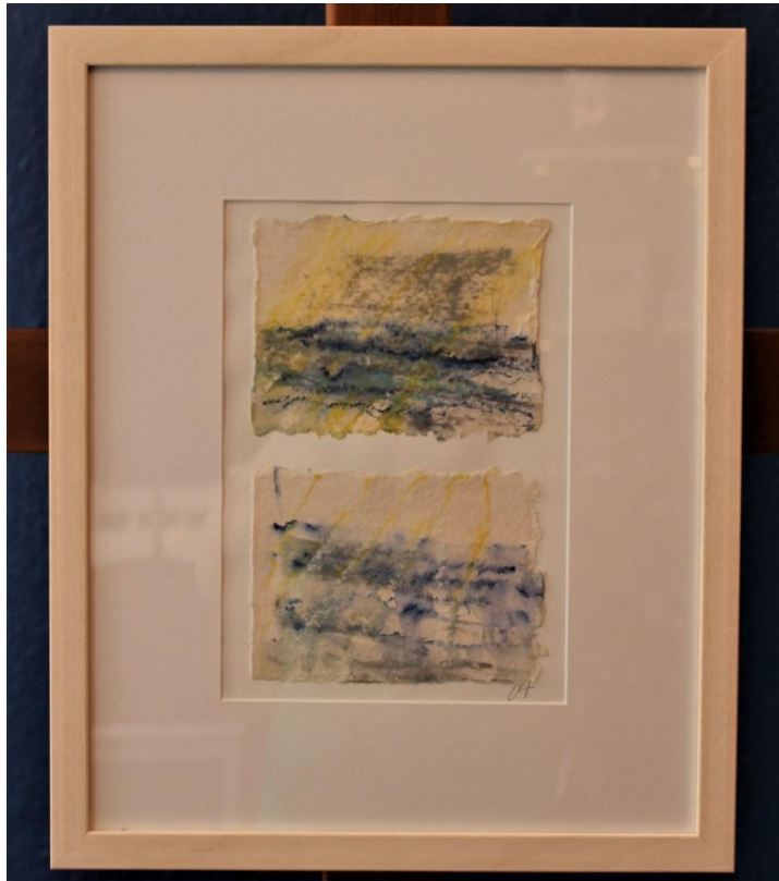
Stories from the sea VI: mixed media and sea water 2 panels 37 x 46 cm £220.00

Wee Blue Press is run by printmaker Emma Jones: