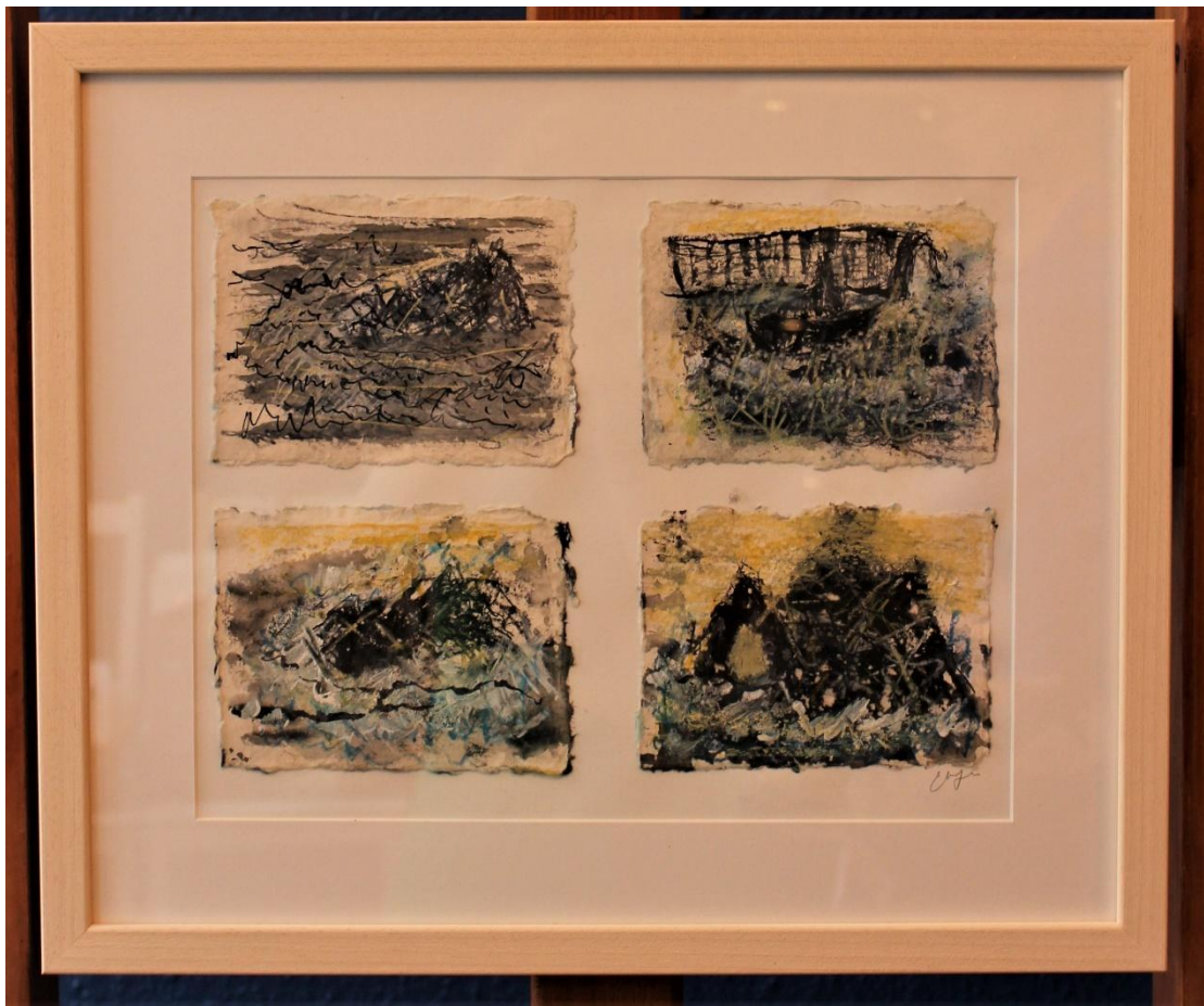
Stories from the sea I: mixed media and sea water 4 panels 49 x 41 cm £295.00