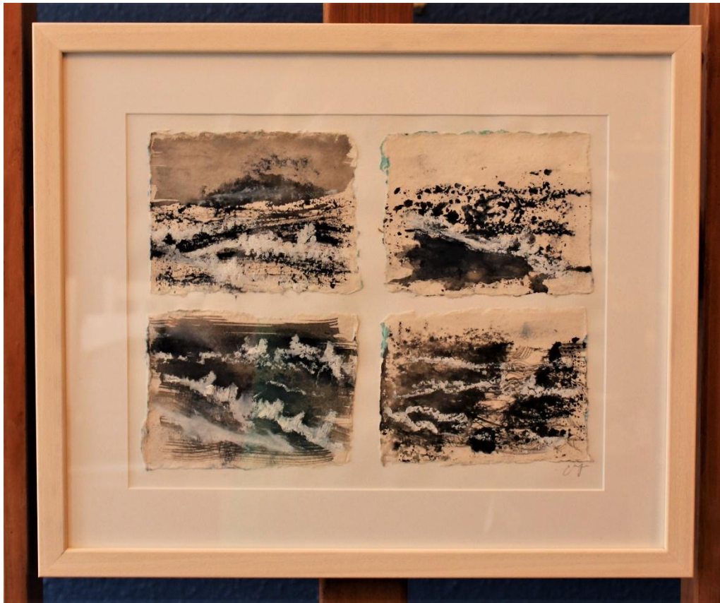
Stories from the sea II: mixed media and sea water 4 panels 49 x 41 cm £295.00