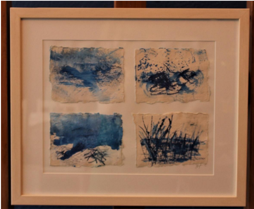
Stories from the sea IV: mixed media and sea water 4 panels 49 x 41 cm £295.00